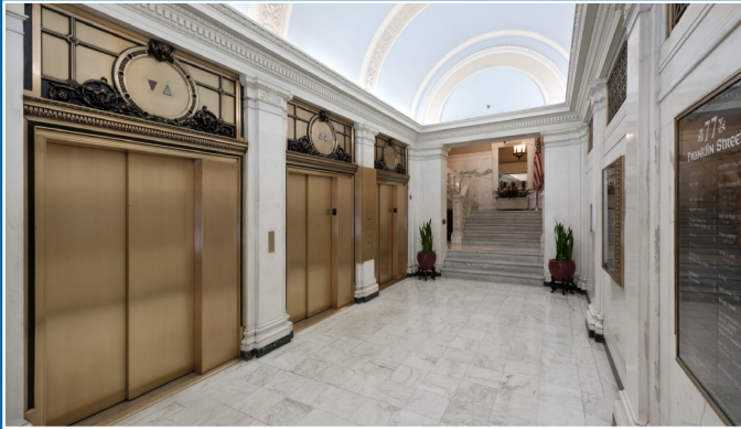
RENDERING COURTESY OF GROUND INC.